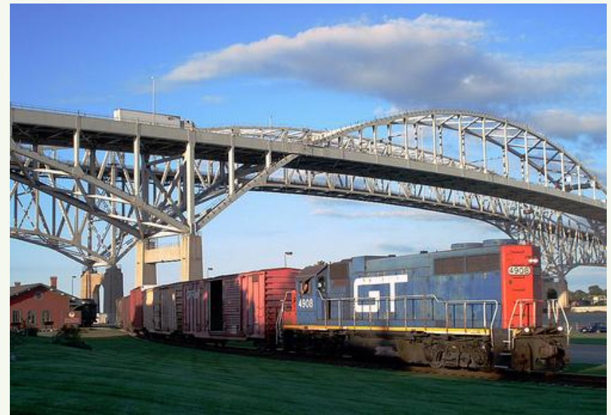
Blue Water Bridge, Port Huron, MI