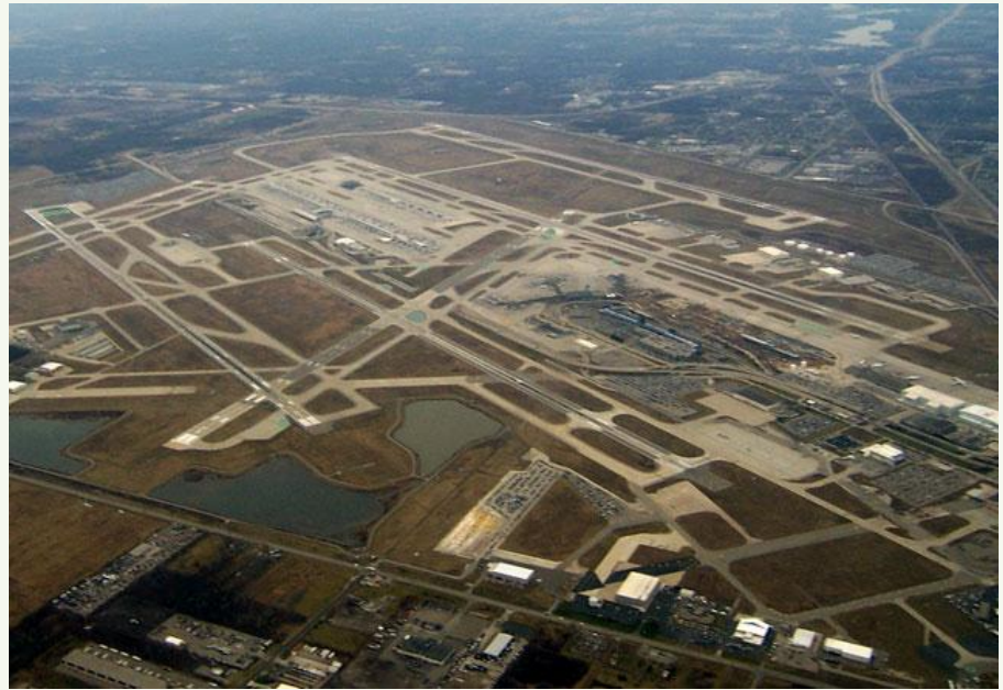
Detroit Metropolitan Airport