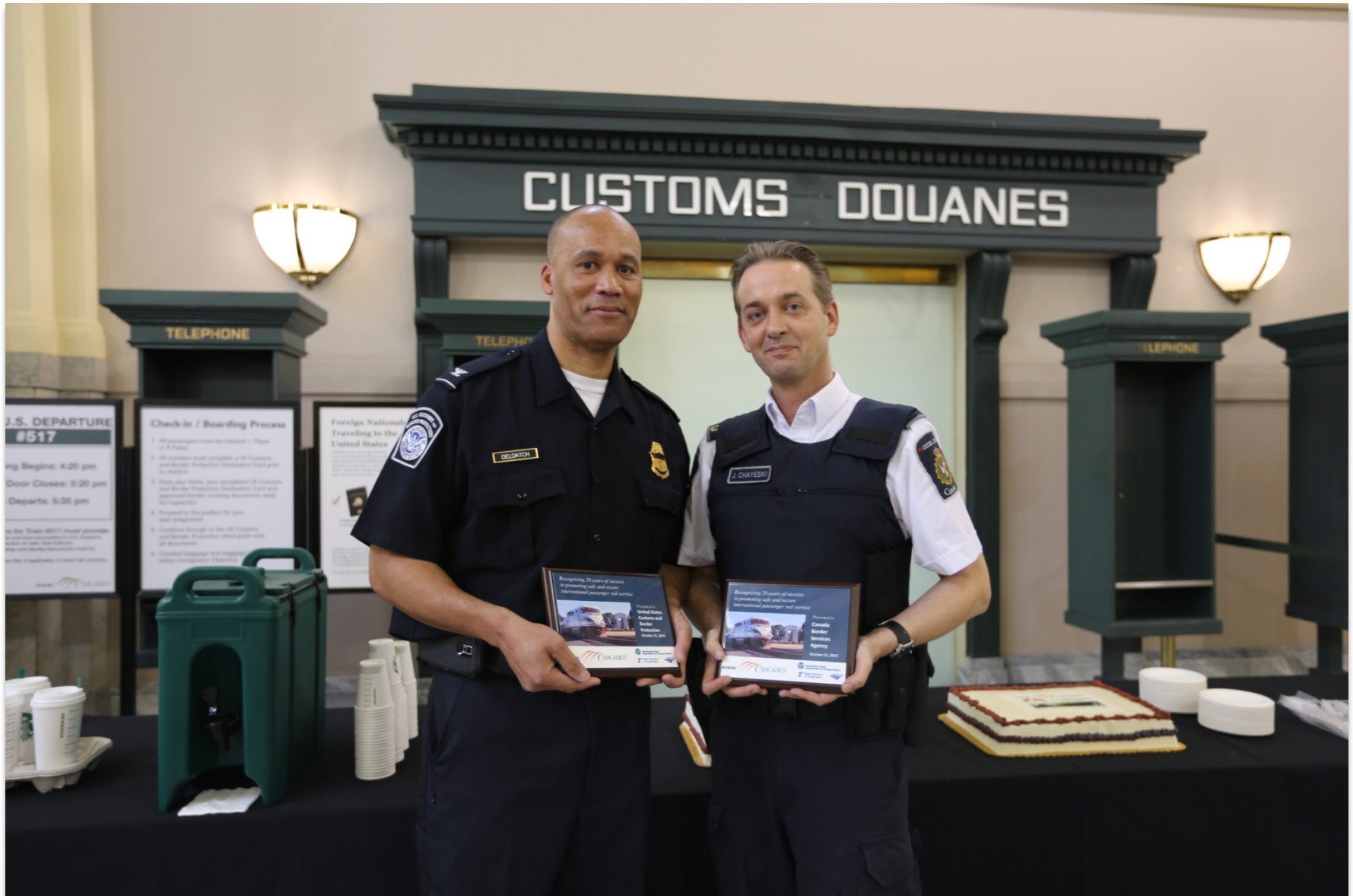
U.S. CBP and CBSA officers pose with awards presented by WSDOT, ODOT and Amtrak for 20 years of safe operations at Pacific Central Station – October 21, 2015