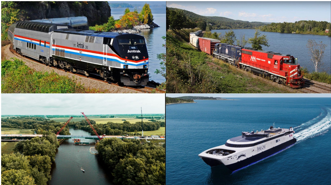
Sources: Epic Adirondack Train Ride Lets You Experience Fall Foliage in a Whole New Way The Importance of Rail to Transportation in Vermont pont-riv-aux-brochets-automne-2024.jpg (4032x2268)